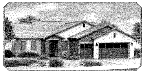
Exterior Design C

Standard Livable Space Optional Livable Space Standard Concrete Areas Optional Concrete Areas