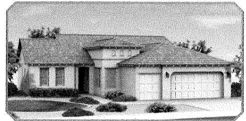
Exterior Design B