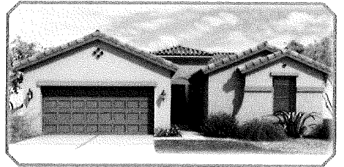
Exterior Design B